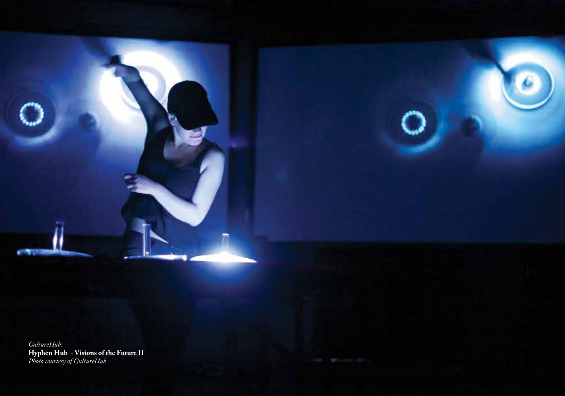
CultureHub: Hyphen Hub - Visions of the Future II