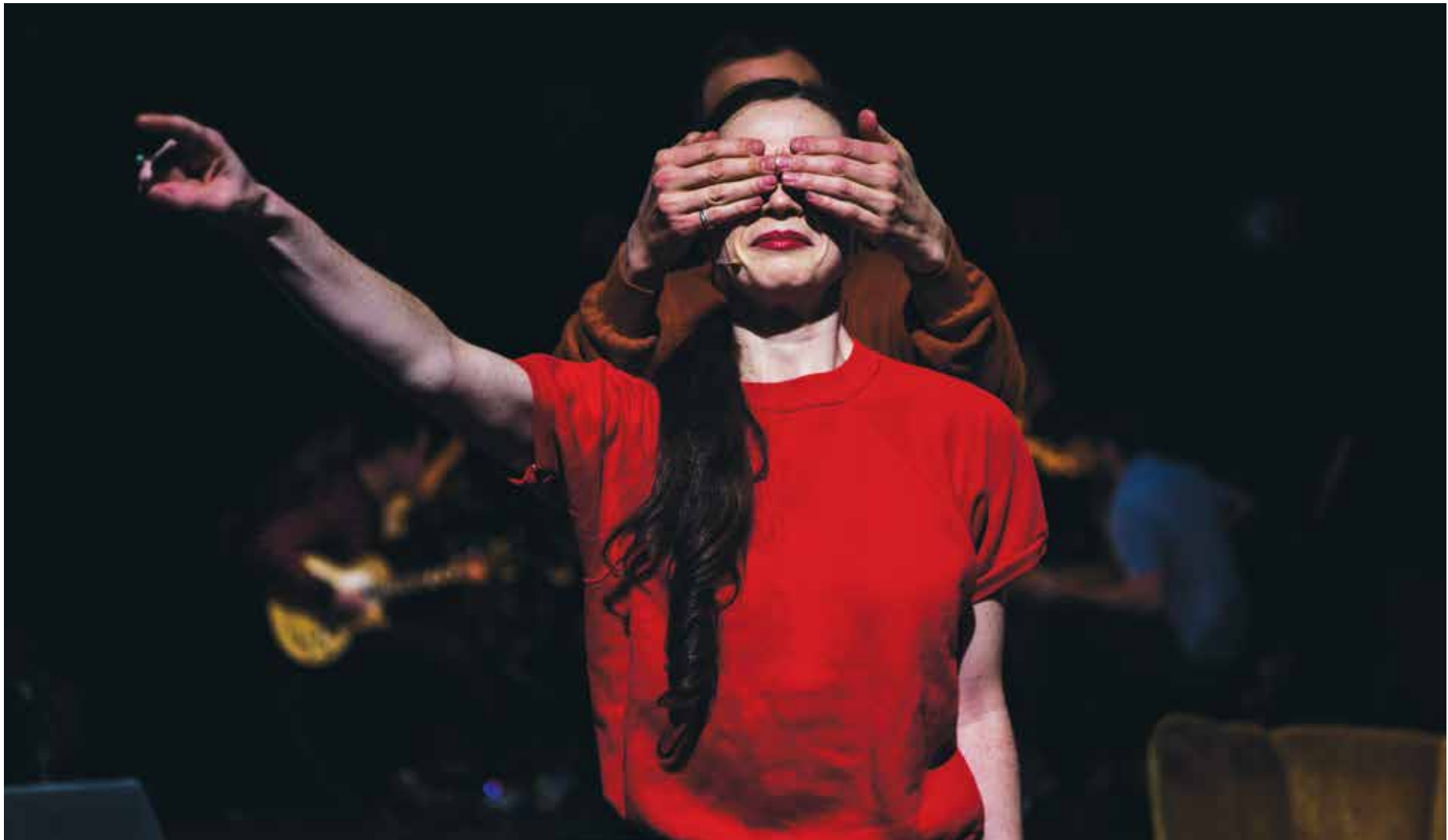
IT'S ALL TRUE By Object Collection