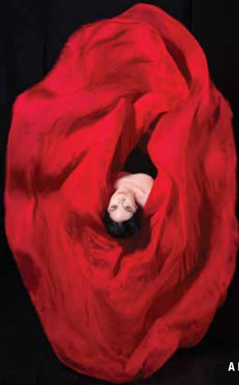
WILDFLOWERS, A FEMININE GENESIS ©Maureen Fleming