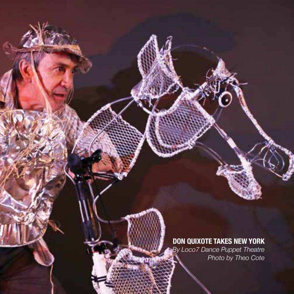
DON QUIXOTE TAKES NEW YORK By Loco7 Dance Puppet Theatre