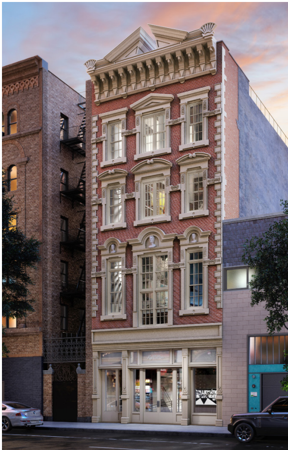
Rendering: 74 East 4th St.

La MaMa's historic, landmark building at 74 East 4th Street is undergoing an urgently needed complete renovation and restoration to preserve the historic façade, create building-wide ADA accessibility, and provide much needed performance, exhibition and community space for decades to come.